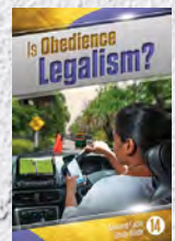
Study Guide 14: Is Obedience Legalism?

When you have completed the first 14 Study Guides, ask about our advanced set by writing: Amazing Facts India, Post Box No 51, Banjara Hills, Hyderabad - 500034