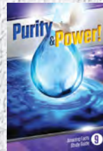
Study Guide 9: Purity & Power!