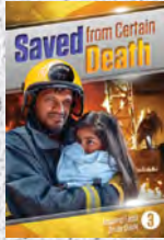
Study Guide 3: Saved from Certain Death