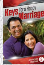
Study Guide 5: Keys for a Happy Marriage