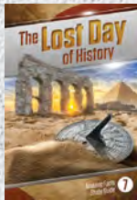
Study Guide 7: The Lost Day of History