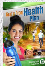
Study Guide 13: God's Free Health Plan