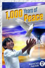
Study Guide 12: 1,000 Years of Peace