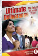
Study Guide 8: Ultimate Deliverance