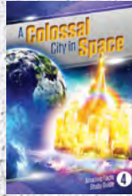
Study Guide 4: A Colossal City in Space