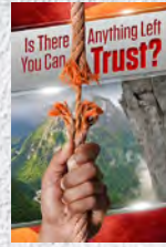
Study Guide 1: Is There Anything Left You Can Trust?

Each lesson is filled with amazing facts that will transform you and your family and bring you lasting hope. Don't miss a single one!