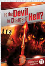
Study Guide 11: Is the Devil in Charge of Hell?