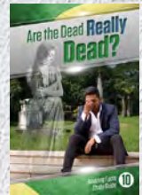
Study Guide 10: Are the Dead Really Dead?