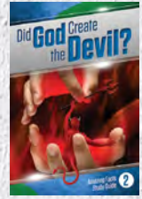
Study Guide 2: Did God Create the Devil?